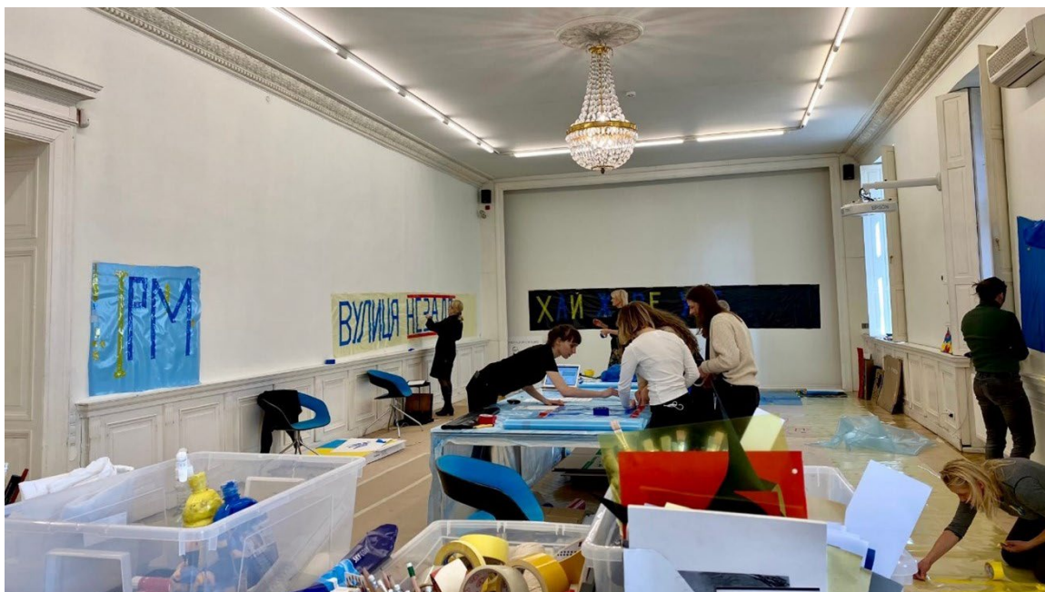
Participation workshop in a support for Ukraine