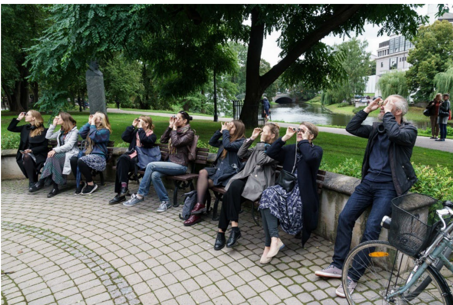
Photo: New Theatre Institute of Latvia, performance "since then the trees don't talk anymore"

In general, it can be observed that the NTIL is one of the rare cultural organizations in Latvia, whose activities are particularly concerned about climate change and the idea of environmental sustainability is important. This organization, along with the interest and desire of the involved employees themselves to learn long-term environmental practices, successfully transfers this knowledge to society through art and culture processes, educating and speaking more broadly about climate change issues.